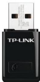
Tp-Link TL-WN823N Mini Wireless N USB Adapter

For those who have out of the way modems, the easiest, most reliable solution is to install a wireless USB adapter on the desktop. These little miracles are inexpensive and small and just plug into one of the USB ports on your computer. You can buy them online or pick one up at Walmart. In most cases, you don't have to install any software, you just plug it into the computer, and then join the desktop to your home Wi-Fi. Expect to pay around $25. The one pictured below goes for $22.93 at Walmart.